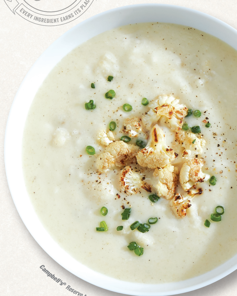
Campbell's® Reserve Aged White Cheddar & Cauliflower Bisque