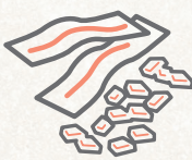
diced smoked bacon