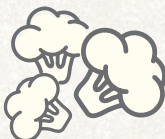
roasted cauliflower florets