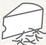
shredded white cheddar