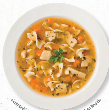
Campbell's® Signature Reduced Sodium Chicken Noodle

This vegetarian delight is full of pureed and diced tomatoes, fresh cream, chopped basil and roasted garlic, along with a variety of spices for seasoning.