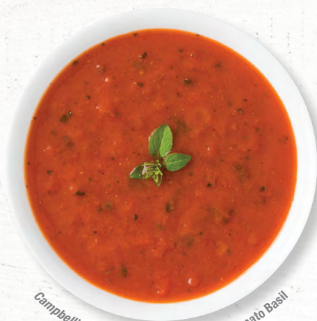
Campbell's® Signature Reduced Sodium Tomato Basil

Campbell's® Signature Reduced Sodium* soups are carefully crafted and available in familiar and well-loved flavors with 293mg of sodium per 6 oz. serving. We're here to help you meet a variety of patient, resident and guest demands; reduce rising labor costs; and find an easier alternative to making reduced sodium soups from scratch. You'll be proud to serve them as delicious sides or meals.