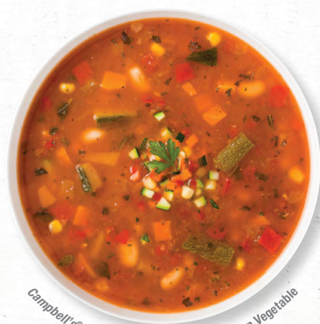
Campbell's® Signature Reduced Sodium Vegan Vegetable

It's a classic for a reason. Tender chunks of white-meat chicken, egg noodles, diced vegetables, and a blend of herbs and spices mix with a home-style chicken stock.