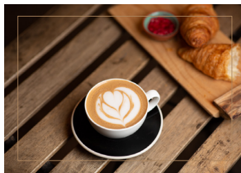
Unsweetened Almond Caramel Mocha