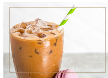
Iced Butterscotch Hemp Latte

For recipes and additional information, visit www.pacificfoodservice.com