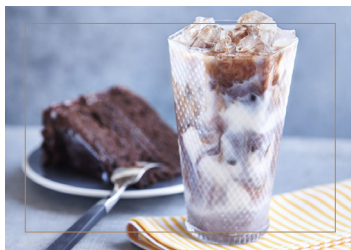
Iced Lavender Almond Mocha