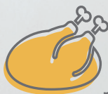
rotisserie pulled chicken