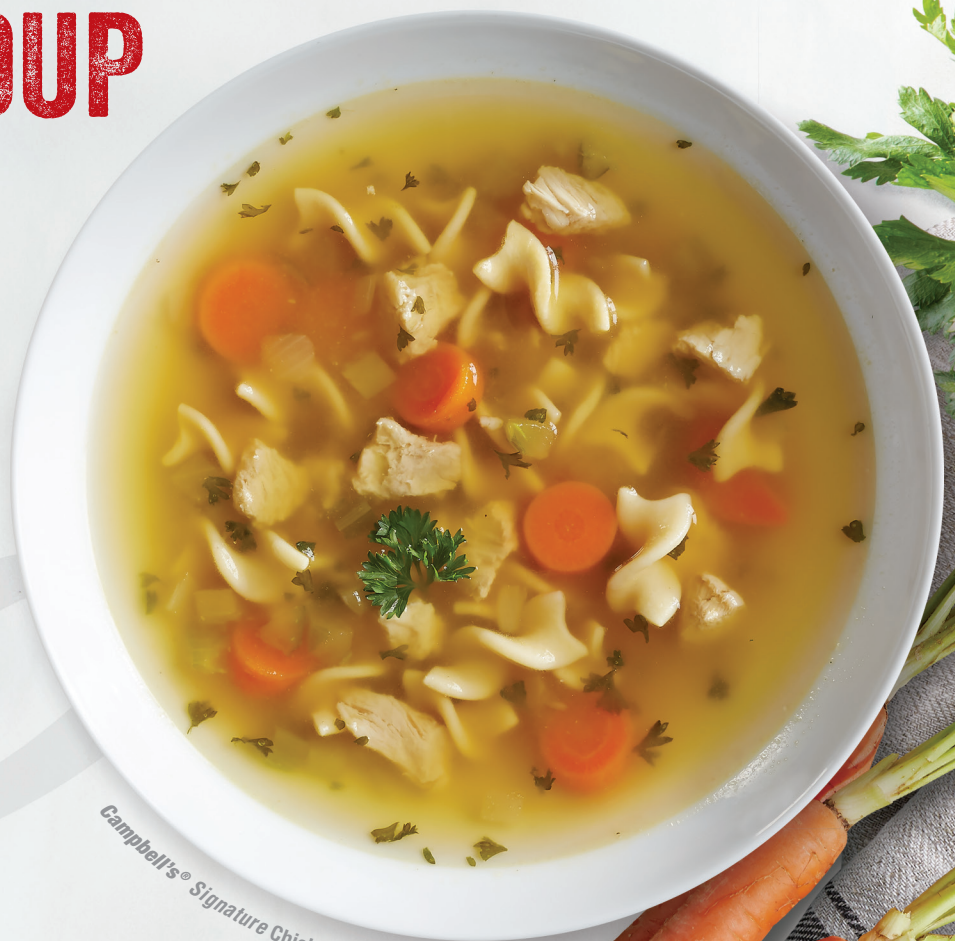
Campbell's® Signature Chicken Noodle