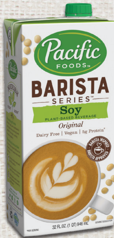
Soy Original Item#: 04292