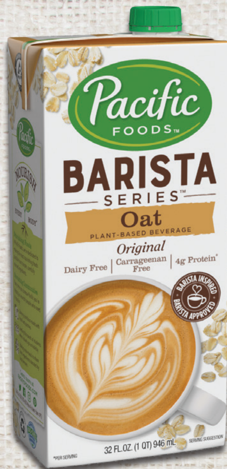
Oat Original Item#: 04320

WINNER BEST NEW PRODUCT 2018 SPECIALTY COFFEE ASSOCIATION SPECIALTY BEVERAGE FLAVOR ADDITIVE