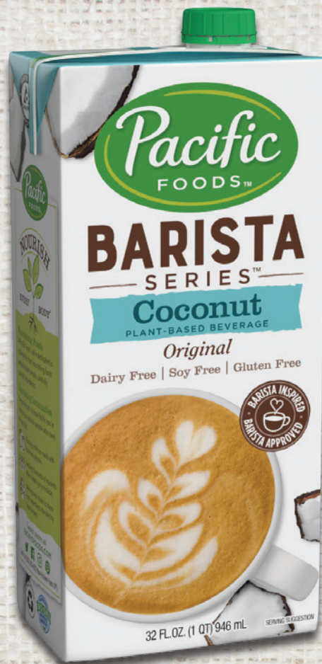
Coconut Original Item#: 04313