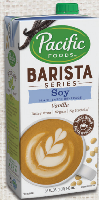
Soy Vanilla Item#: 04294